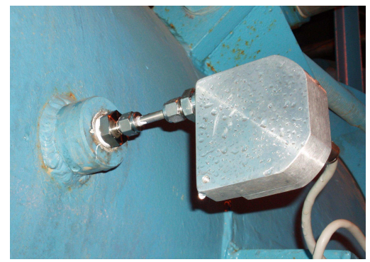
Figure 1: Fixed installation for continuous monitoring. The temperature probe is inserted into a thermowell.

Figure 2: Portable test. Temperature and pressure probes are connected to the same tapping point via a T-piece. The probes are battery powered and a wireless modem transfers the signals to a notebook computer situated at a convenient location.