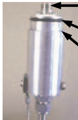
Figure 3. Probe for wet-well measurements, with either portable or fixed units.