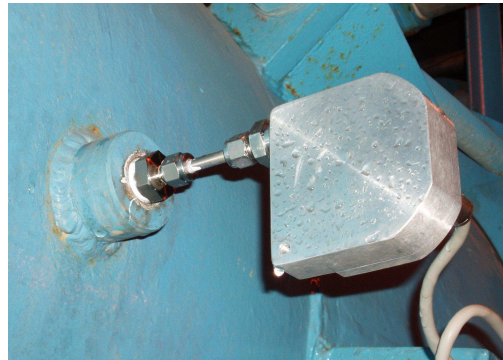
Figure 1: Fixed installation for continuous monitoring. The temperature probe is inserted into a thermowell.